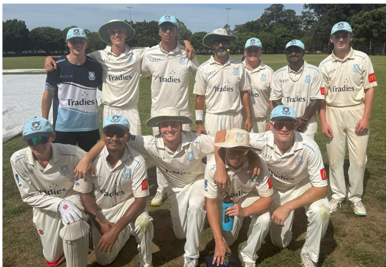
Metro Cup team after Qualifying Final win over Fairfield-Liverpool at Sutherland Oval: